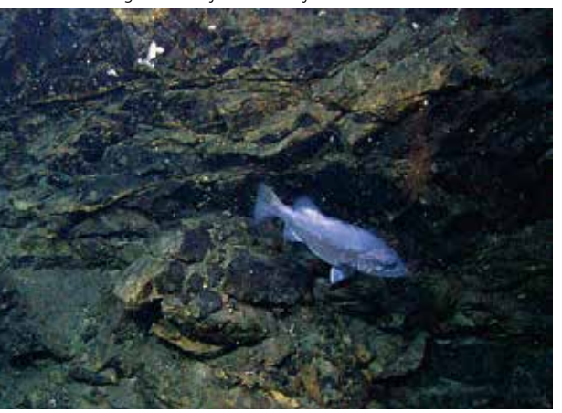
A serpentinite outcrop forms the south wall of the Atlantis Massif in the Lost City Hydrothermal Field. This image was taken by the remotely operated vehicle Hercules during an exploration of the area in 2003.

of the sea. In areas of seafloor spreading, oceanic peridotite has been pushed upward from Earth's mantle to the seafloor by convection currents carrying heat from the Earth's core toward the surface. The olivine and pyroxene in the peridotite react with seawater to form serpentine.