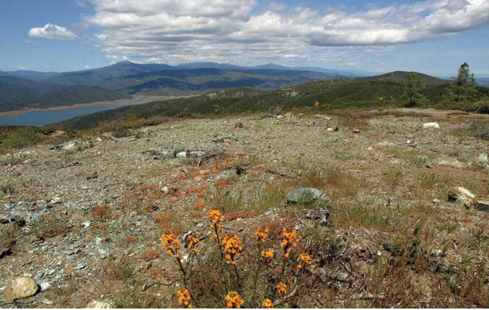
Serpentine habitat and Western wallflower (Erysimum capitatum).

individuals advocate that renewable energy be sited where impacts to sensitive habitat and species can be avoided. Our society needs to curb its reliance on fossil fuels to solve the problem of climate change, but it seems irresponsible to try to solve that problem by exacerbating another problem, the loss of biodiversity. Perhaps the most frustrating piece of the equation is that Walker Ridge does not possess wind resources of the quality typical of other sites developed for commercial wind energy. It seems criminal to want to squander what is truly rare, unique, and special for a mediocre source of renewable energy. We should focus first on developing wind and solar energy in places where environmental impacts are negligible, like rooftops, parking lots, abandoned agricultural fields, and disturbed lands.