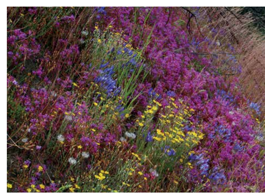
A wonderful display of wildflowers including red ribbons ( Clarkia concinna ), Ithuriel's spear ( Triteleia laxa ), and woolly sunflower ( Eriophyllum lanatum ).

Responding to the persistent threat of development, CNPS petitioned BLM in 2005 and 2011 to designate Walker Ridge as an Area of Critical Environmental