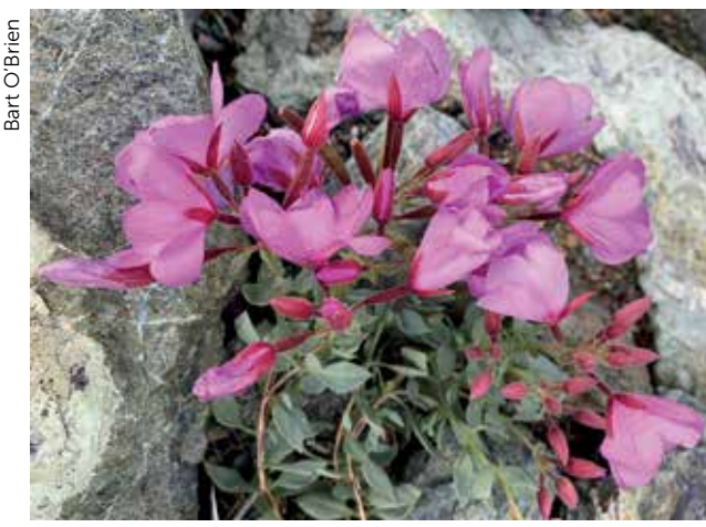
Siskiyou Mountains willow herb ( Epilobium rigidum ) in the Garden's serpentine bed.

Calamagrostis ophiditis is an attractive grass growing in the upper part of the Garden's serpentine bed and is one of the few serpentine endemics in the grass family (Poaceae). The species growing in the Garden was collected from Carson Ridge in Marin County and can also be found on the Tiburon Peninsula, on and around Mt. Tamalpais, and in Sonoma,