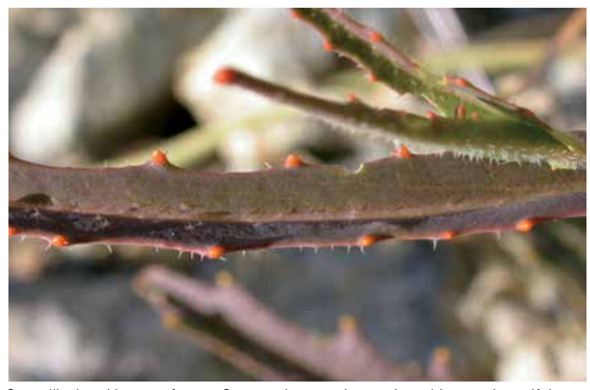
Strap-like basal leaves of many Streptanthus species, such as this most beautiful jewelflower ( Streptanthus albidus subsp. peramoenus ; Brassicaceae), have small orange-red callosities along leaf edges that mimic the eggs of spring white butterflies ( Pontia sisymbrii ), which lay orange or red eggs similar in size and shape. These butterflies may assess the egg-load on plants as they fly by, leaving these falsely-loaded Streptanthus plants in the clear.

normal soils), evolved traits that allow plants to survive in the harsh conditions but also prevent them from being able to reproduce with other plants, or different pollinator behavior that drives plant survivorship and its ability to