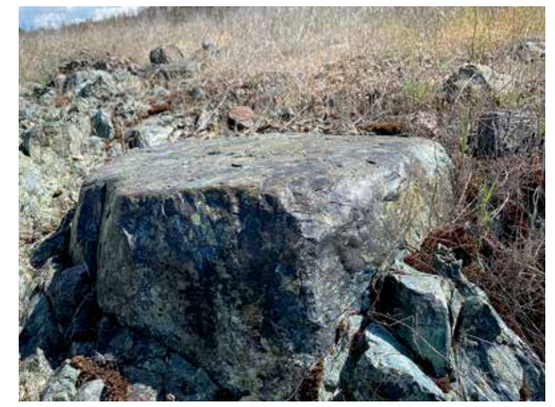
Waxy serpentinite, Missimer Snell Wildflower Preserve, Napa County, California.

Scientists estimate the metamorphic process of serpentinization consumes approximately 300 liters (79 US gallons) of water per cubic meter of rock that is transformed into serpentinite. That involves a lot of hydrogen and oxygen, and scientists speculate that the process may have fueled life on other planets, including Mars and Saturn's sixthlargest moon, the tiny Enceladus (whose diameter is only 314 miles). Serpentinization is also being used as a model by planetary scientists to help explain the development of planetesimals (very small planets, and a very fun word).