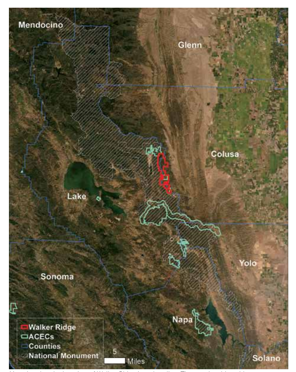
Map showing the location of Walker Ridge in red outline. The area in white with diagonal lines is Berryessa Snow Mountain National Monument. Existing Areas of Critical Environmental Concern (ACECs) appear in teal. County names are in white.

The ridge looms over Bear Valley, where many people, in years with ample precipitation, flock to experience wildflower displays that rival those of North Table Mountain or the Carrizo Plain. The area's vast fields of California poppies ( Eschscholzia californica ), lupine ( Lupinus spp.), and adobe lily ( Fritillaria pluriflora ) are cherished by thousands of visitors. Walker Ridge rises for more than 2000 ft, offering views of the surrounding landscape and region that are beyond compare. Along with this gain in elevation, countless drainages, ridges, and topographical features influence habitat diversity; this results in the area hosting more than 450 plant taxa (species, subspecies, and varieties).