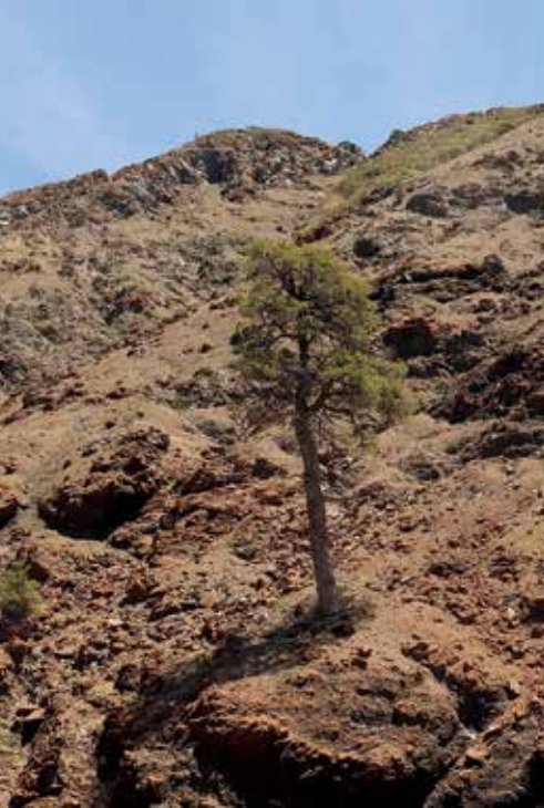
A lone Sargent cypress ( Hesperocyparis sargentii) in The Cedars.