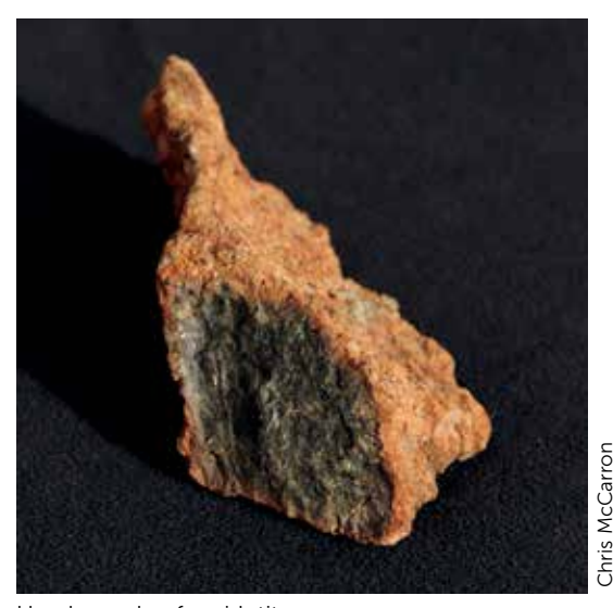
Hand sample of peridotite.