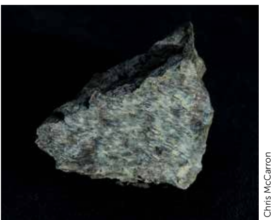
Hand sample of serpentinite.