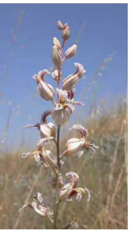
Metcalf Canyon jewelflower ( Streptanthus albidus subsp. albidus ) is found on serpentine soils on Coyote Ridge south of San Jose, Santa Clara County, California.

leaves match the color of the serpentine rocks its roots manage to nestle in; and Metcalf Canyon jewelflower (Streptanthus albidus subsp. albidus), an upright plant with tall spikes of ghost-like white flowers. Streptanthus albidus subsp. albidus, S. albidus subsp. peramoenus, and S. breweri have small but noticeable salmon-orange bumps at the ends of their strap-like leaves midway up the stem that appear when the plant develops its flowers. Butterfly expert Arthur Shapiro with the University of California at Davis believes these bumps are an example of protective egg mimicry by these Streptanthus plants. He theorizes that female California white butterflies (Pontia sisymbrii), thinking that these plants already have eggs laid on them when they do their egg-load assessment, will fly on past.