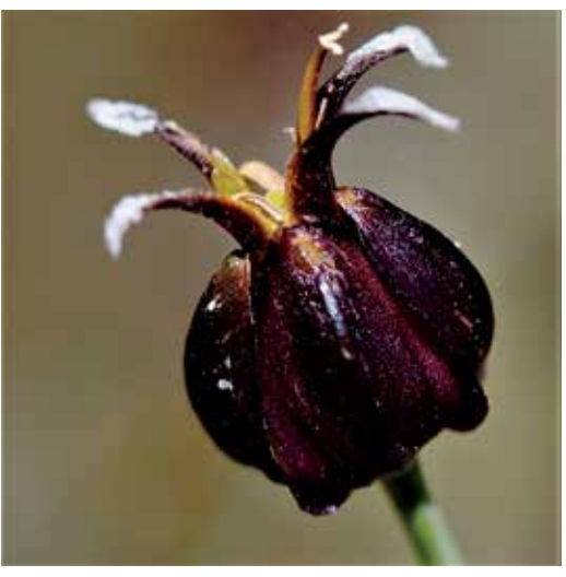
Tiburon jewel-flower (Streptanthus niger).

But of all the flowers sought, the most unique is the Tiburon mariposa lily, Calochortus tiburonensis , found in only a few areas of serpentine outcrops close to the top of the