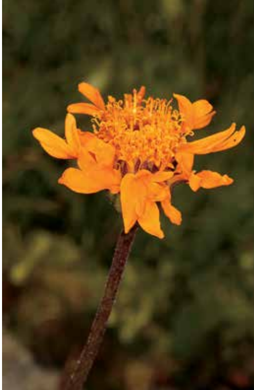
Showy raillardella ( Raillardella pringlei, Asteraceae) is endemic to wet meadows in forest habitats on serpentine soils in the Klamath Mountains.

Species benefitting from the hungry cows include Santa Clara Valley liveforever ( Dudleya abramsii subsp. setchellii ), a cryptic succulent whose