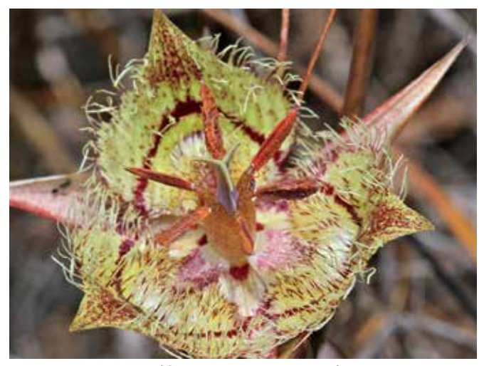
Tiburon mariposa lily (Calochortus tiburonensis).

mountain and, it seems, nowhere else in the world! It was not discovered until late in the twentieth century, partly because it blooms late and partly because its dull colors don't stand out. Each shallowly bowl-shaped flower is pale green, but intricately flecked with dark maroon splotches and lines and dense with shaggy hairs. No other species in our area looks anything like it, and it seems its closest relatives are in drylands of Southern California! Look for it in the rocky, serpentine area several hundred yards before the end of the Phyllis Ellman trail in the Ring Mountain Preserve.