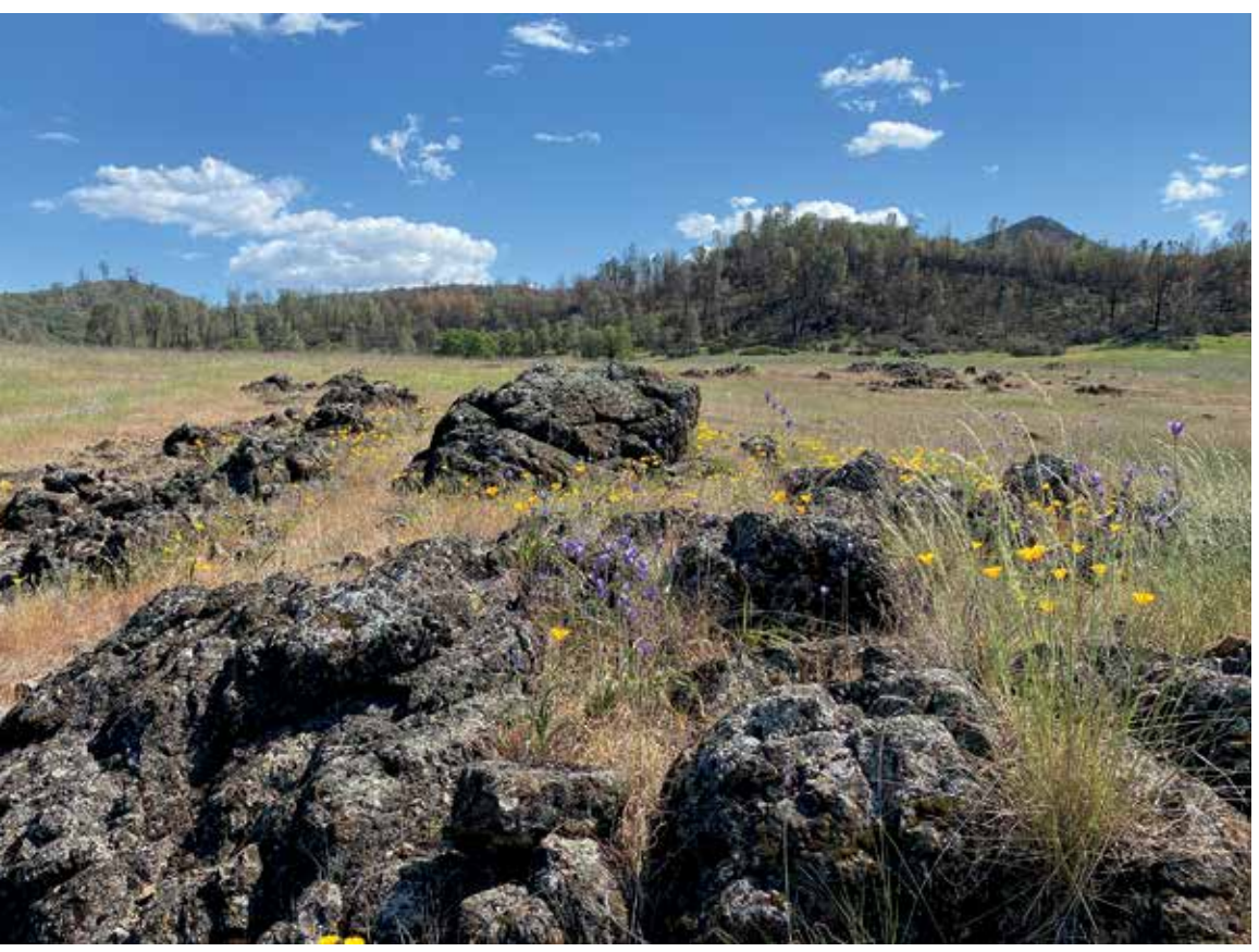
Serpentine grassland, Missimer Snell Wildflower Preserve, Napa County, California in April 2021.

Mountains, and Sierra Foothills), these unique soils are also found in Oregon and Washington in the west and along the folds of the Appalachian Mountain Range in the east. Serpentine soil habitats range from barren moonscapes to sparsely populated forests to technicolor grasslands, and individual plants and even entire plant communities have evolved to exist on them. Just one percent of California's land surface is composed of serpentine soil and rock, yet this soil and rock hosts more than twelve percent of plant species endemic to the California Floristic Province.