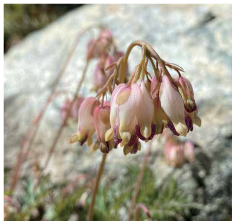
Oregon bleeding heart ( Dicentra formosa subsp. oregana ) grows in the Garden's serpentine bed and is distinguished by its creamy-yellow flowers with rose tips.

Mendocino, and Napa counties. The grass-like serpentine sedge ( Carex serpenticola ) is a nice, tiny sedge found in Del Norte County and southwest Oregon and is growing at the edge of the bog in the Garden's serpentine bed.