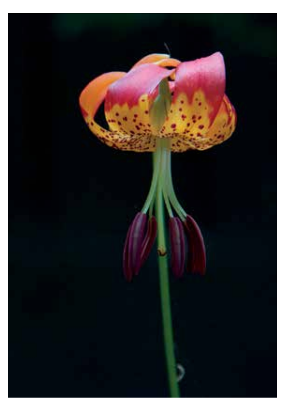
Leopard lily (Lilium pardalinum ssp. pardalinum).

beautiful recurved tepals and how it glowed in its glory even alongside the forest road. It helped me understand, even further, the critical role that proper drainage and sun exposure play in the survival of this species.