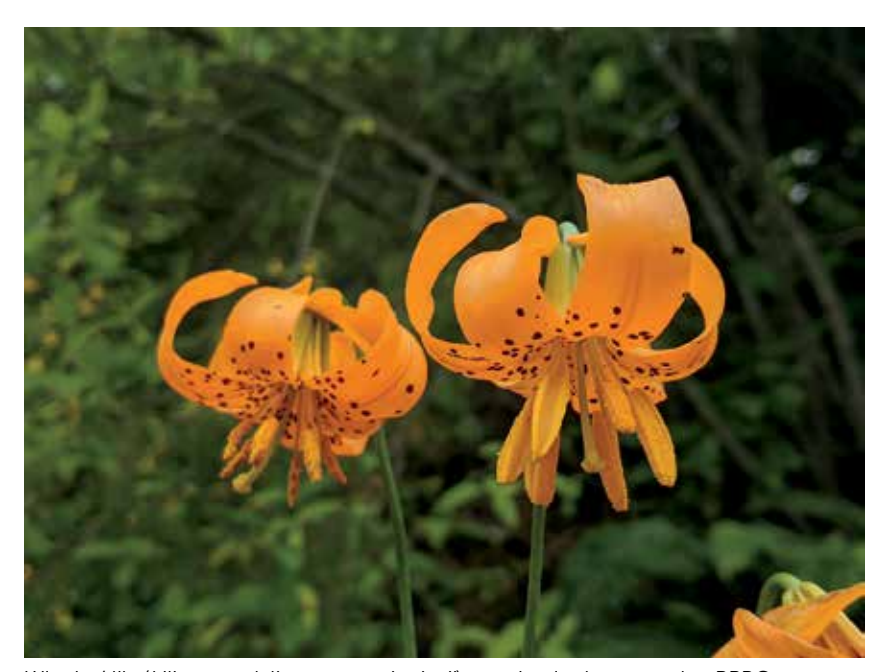
Wiggins' lily (Lilium pardalinum ssp. wigginsii) growing in the ground at RPBG.

although annual rodent tunneling has slowly dwindled it down to just a couple of bulbs. I salvaged damaged bulbs and scales into pots this winter and plan to outplant into cages at some point. Shasta lily ( Lilium pardalinum ssp. shastense ) is native to wet areas of moderate-elevation coniferous forests in northern California and southwest Oregon. The Botanic Garden has a vigorous example in the ground in the Sierran section of the garden, near the Wiggins' lilies. I have heard that this taxon isn't always the easiest to grow, so we may have a nice clone here.