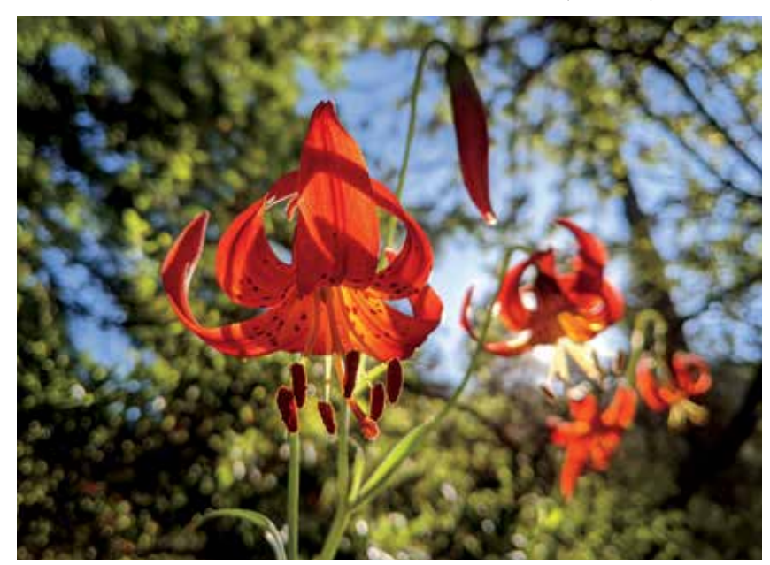
Pitkin lily (Lilium pardalinum ssp. pitkinense) growing in the ground at RPBG.

There are two other leopard lily subspecies I want to mention that are less commonly seen but may lend themselves to summer-watered gardens. Wiggins' lily ( Lilium pardalinum ssp. wigginsii ), from northwestern California and southwestern Oregon, has uniformly yellowy-orange petals. A portion of the stamens are curiously and distinctly "malformed or shrunken" per Jepson. This beauty has been growing in a rocky wall for years at the Regional Parks Botanic Garden,