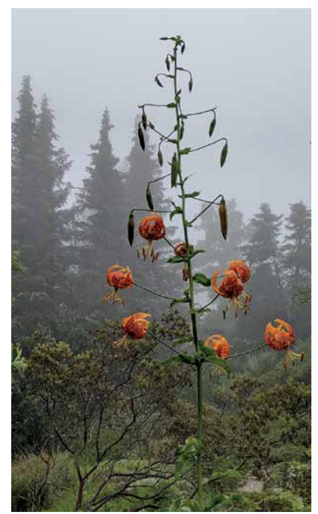
Ocellated Humboldt lily ( Lilium humboldtii ssp. ocellatum ) growing in the ground at RPBG.

Bolander's lily ( Lilium bolanderi ) is a strict serpentine endemic from northwestern California and southwest Oregon, where it grows in chaparral and coniferous forest alongside a number of other frustratingly hard-to-grow plants. It is a charming lily with glaucous (bluish) foliage and reddish-pink, often spotted flowers.