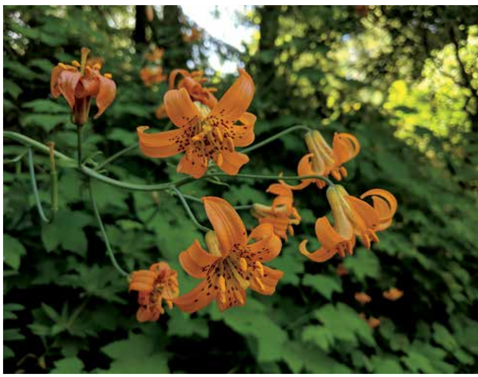
Columbia lily (Lilium columbianum) growing in the ground at RPBG.