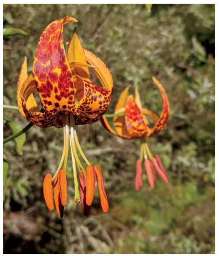
Ocellated Humboldt lily ( Lilium humboldtii ssp. ocellatum) growing in the ground at RPBG.

Moving on from the leopard lily ensemble, let's look at the alpine lily, or Sierran tiger lily ( Lilium parvum ), which is a California endemic of moderate to high elevations in the Sierra Nevada. Note that growing conditions at high elevation are dramatically different than in the Bay Area, with life under snow in winter and a short, wet, cool growing season. Lilies and many other plants from high elevation areas can be very tricky to grow in the Bay Area. The spotted, funnel-shaped flowers of the alpine lily show variation across the species range. There is a popular pink-flowered selection called 'Halliday' from lower elevations that is reportedly more growable.