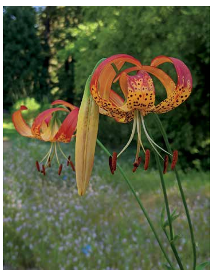
Lilium pardalinum var. giganteum in a pot at RPBG.

above what often becomes a water channel: all the pieces are there! In the garden, we can cater to the more finicky lilies by putting them in pots or mounds or planters or otherwise customized planting beds using well-draining mixes. Regular repotting, particularly with the hard-to-grow species, is essential. Bulbs often move downward in the pot and are prone to rot if they reach the bottom. Repot lilies when they are "dormant" (lilies never go completely dormant). Be careful about repotting just as they are pushing fragile new growth in late winter. Wayne Roderick grew many native lilies and wrote, "If grown in containers, they must be repotted every year or two, as the soil mix breaks down and will become waterlogged, which is sure death to bulbs."