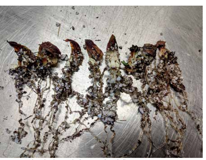
Lily scales showing the formation of new bulbs.

and breakable. Lily shoots that are broken at any stage may not push growth again until the next season.