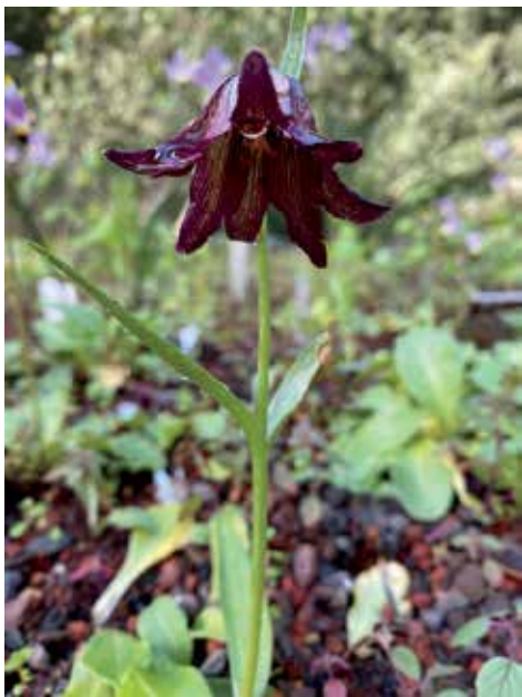
Fritillaria biflora Fritillarias in the bulb beds.