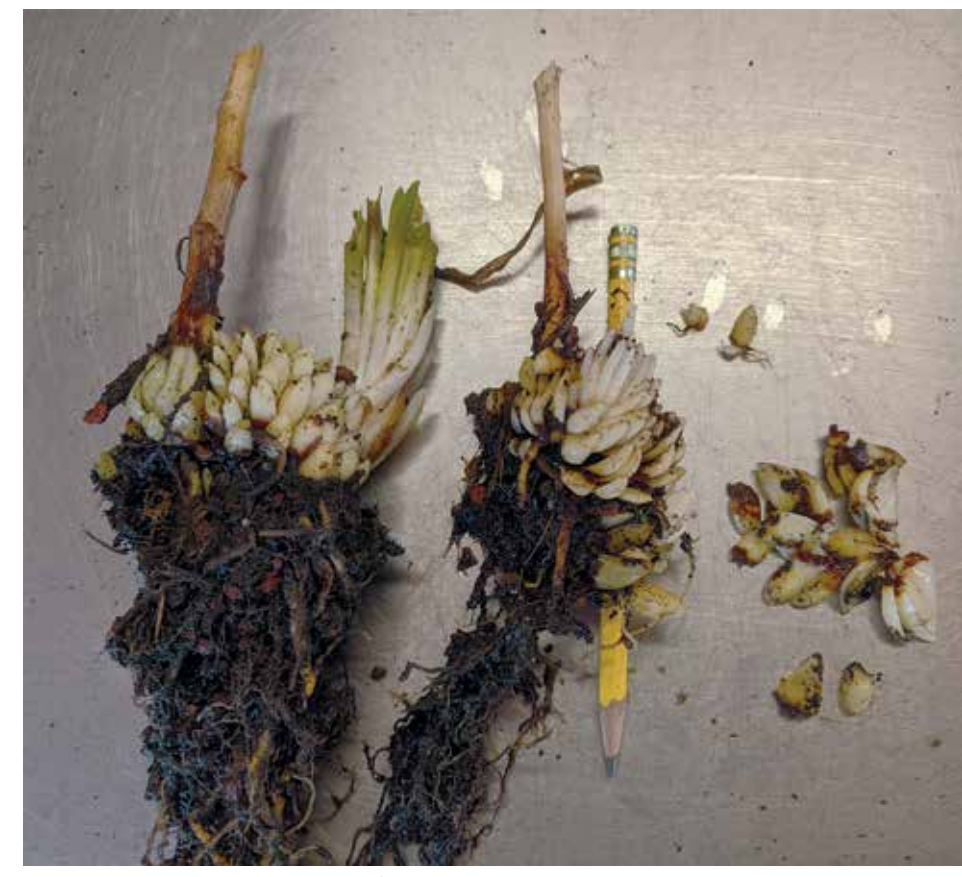
Healthy new spring growth pushing from lily bulbs with some scales exhibiting rot.

Lilies can get viruses, which are transmitted via sucking insects, so insect control is important; aphids in particular are a common problem.