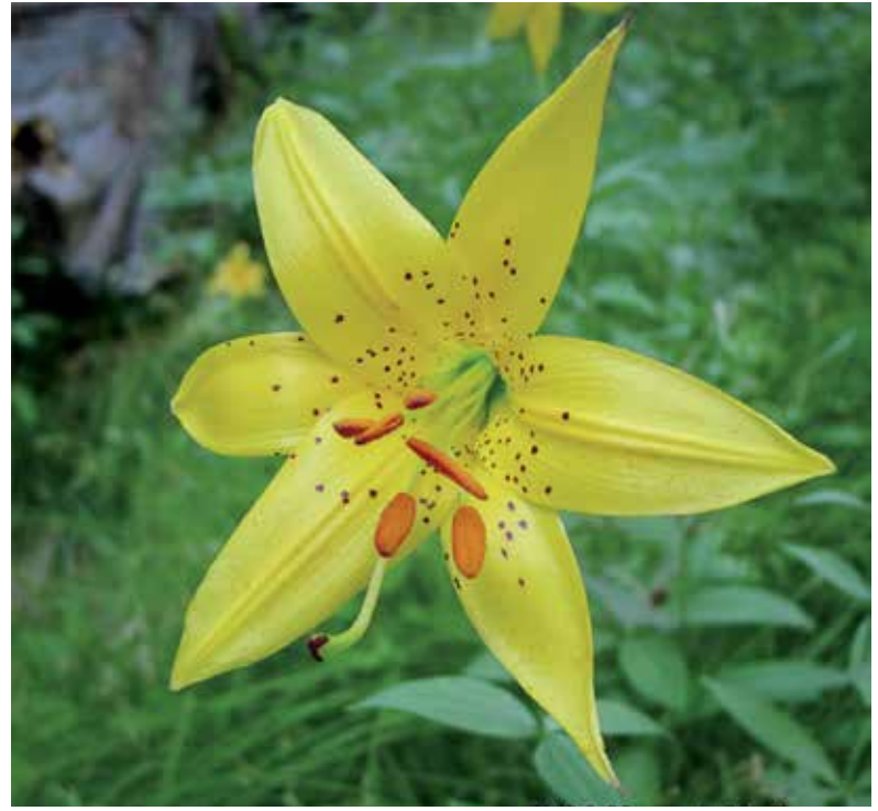
Parry's lily (Lillium parryi)

http://tchester.org/sj/species/lilium_parryi/index.html