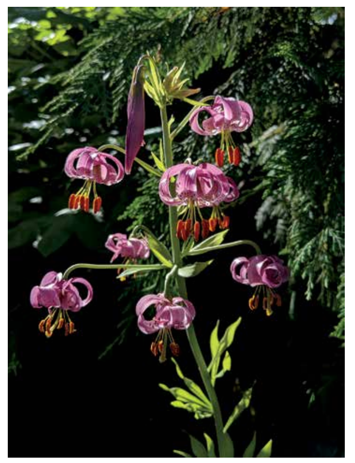
Kellogg's lily (Lilium kelloggii) growing in the ground at RPBG.

Kellogg's lily ( Lilium kelloggii ) is a notably fragrant lily, often but not always found on serpentine in a geographical footprint similar to Lilium bolanderi . It has very striking pendant, pinkish, bell-shaped flowers with a yellow midrib. You may have seen this one flowering in container culture and in the ground at the Regional Parks Botanic Garden. This is another lily that has been used in crosses for its unique color and fragrance. Despite my allergy to this particular shade of pink, I really enjoyed finding this flowering by the hundreds on a desolate, charred ridge among as many manzanita skeletons.