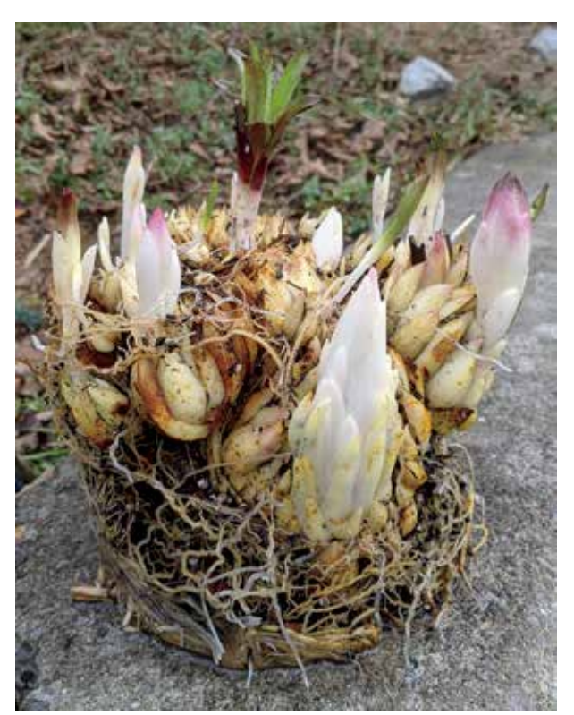
A crowded pot of lily seedlings in desperate need of attention at the author's home.