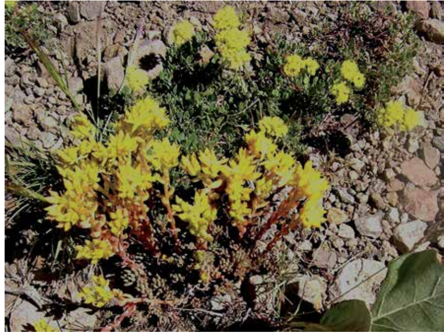
Sedum stenopetalum growing in subalpine rock rubble.