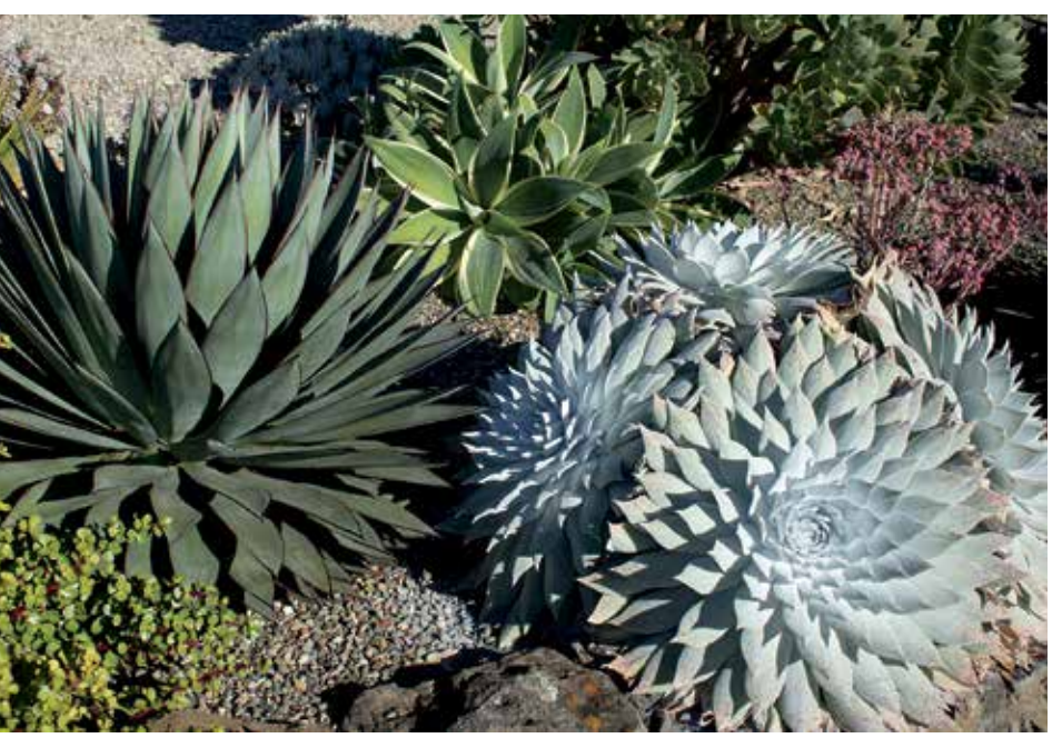
Britton's liveforever (Dudleya brittonii) against Agave 'Blue Glow'

The Laguna Beach dudleya ( D. stolonifera ) is the only liveforever that produces stolons. It was rare enough that conservationists managed to get parks set aside, partly to protect it. I have been particularly involved in the restoration of the rare Verity's dudleya ( D. verityi ) after the Camarillo Springs Fire of May, 2013, burned through all populations of an already endangered species. These are just two of more than 30 species threatened in the wild. ( Dudleya stolonifera is the t-shirt logo of the Orange County chapter of the California Native Plant Society. Similarly, the Channel Islands chapter has