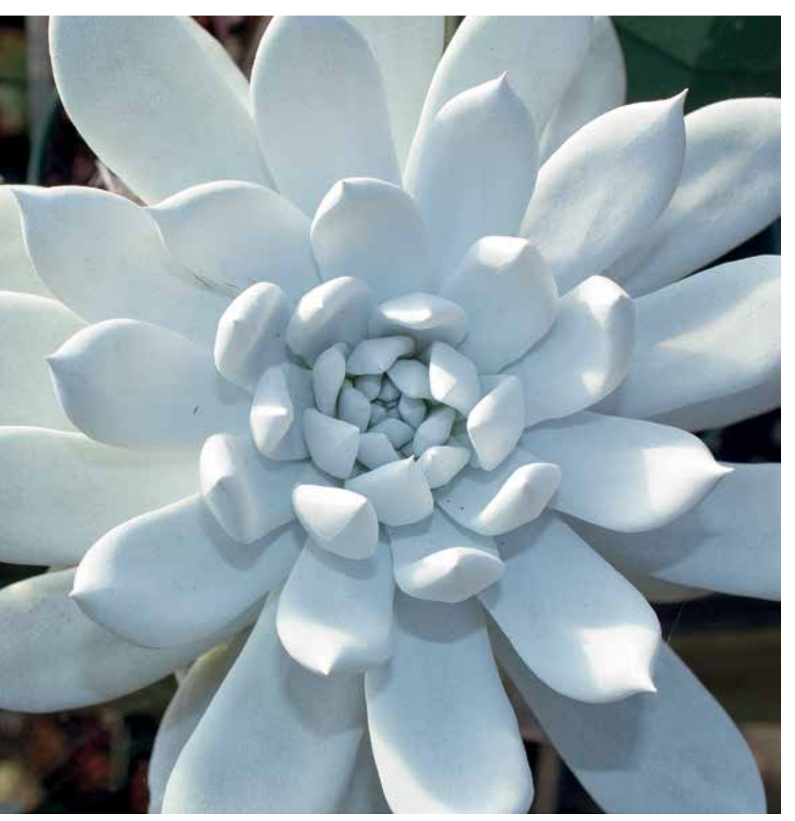
A cross of the Cedros Island liveforever with the chalk dudleya or Anthony's liveforever, made in cultivation by McCabe.

we can a plant tough enough to survive being taken out of the ground, pressed between cardboard, and set aside for a year, recover from this abuse to be an attractive garden plant once again—and still be in danger in the wild? There are a number of mysteries about the liveforever (genus Dudleya ), but the ability to survive certain kinds of stress is one of the more interesting ones.