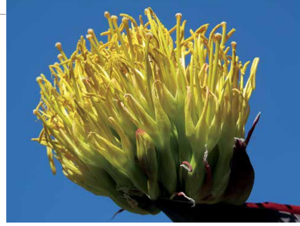
Shaw's agave (Agave shawii)

The two known Californian populations are from San Diego County: the first at the US Naval Supply Center, San Diego, Point Loma Annex, around the midpoint on the Point Loma peninsula on the west side; and the second at Lichty Mesa, literally along the international border at Border Field State Park-the southwestern-most point of the continental United States. While Roof collected 3 or 4 pups and seeds from the Naval Supply Center population on May 9, 1970, he collected only a single pup from the larger Lichty Mesa population on November 22, 1974. Why only one pup from Lichty Mesa? Roof didn't directly say, but he did note that the Lichty Mesa population had few pups available at the time he made his collection. It is quite unusual for an Agave shawii var. shawii population of that size to