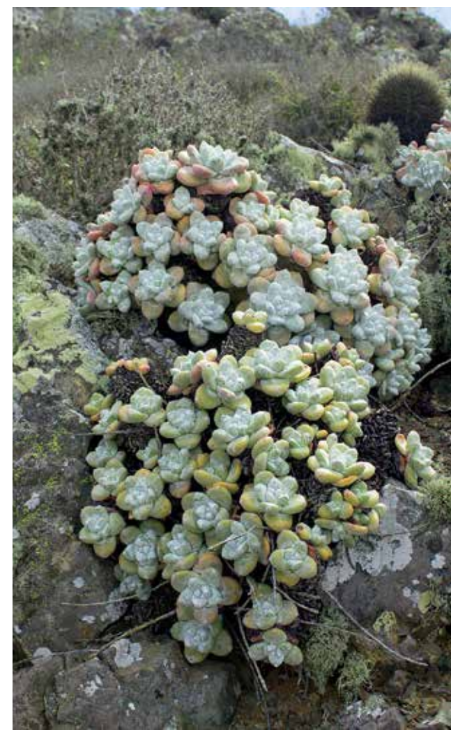
Cedros Island liveforever (Dudleya pachyphytum)