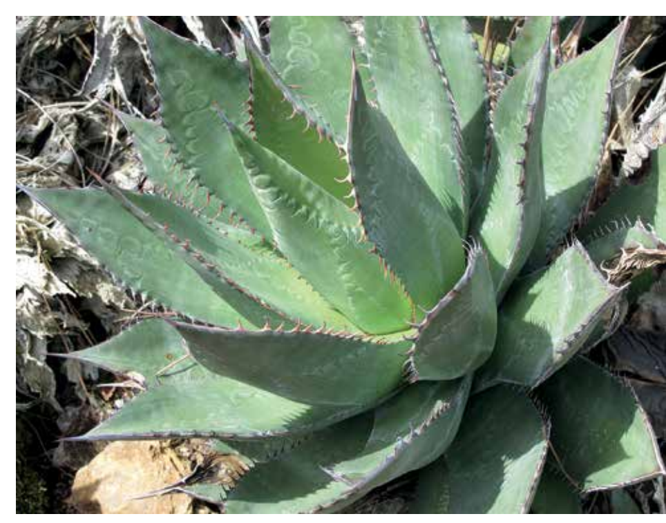
Shaw's agave (Agave shawii)

have few pups, and could indicate that this population was unusual or that others had previously collected the young pups.