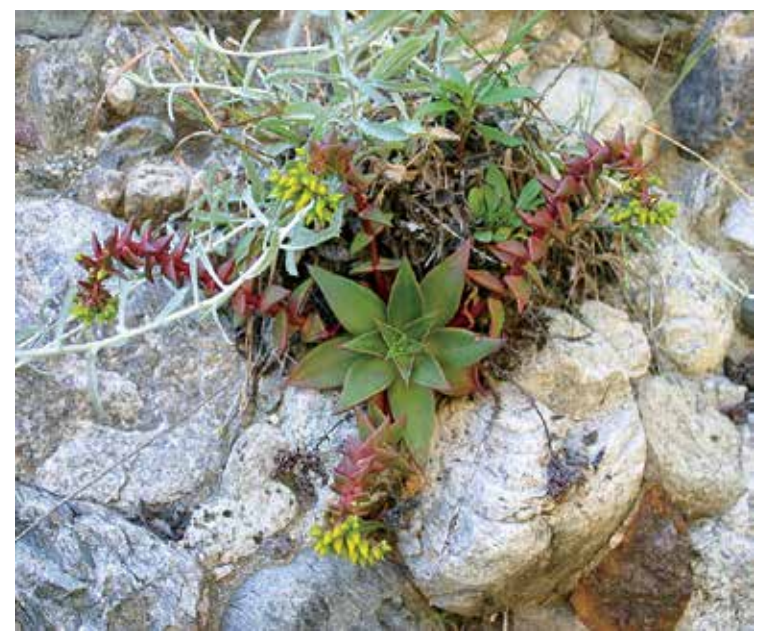
Dudleya cymosa subsp. ovatifolia

using the Santa Monica dudleya ( D. cymosa subsp. ovatifolia ) as the main source of genes.