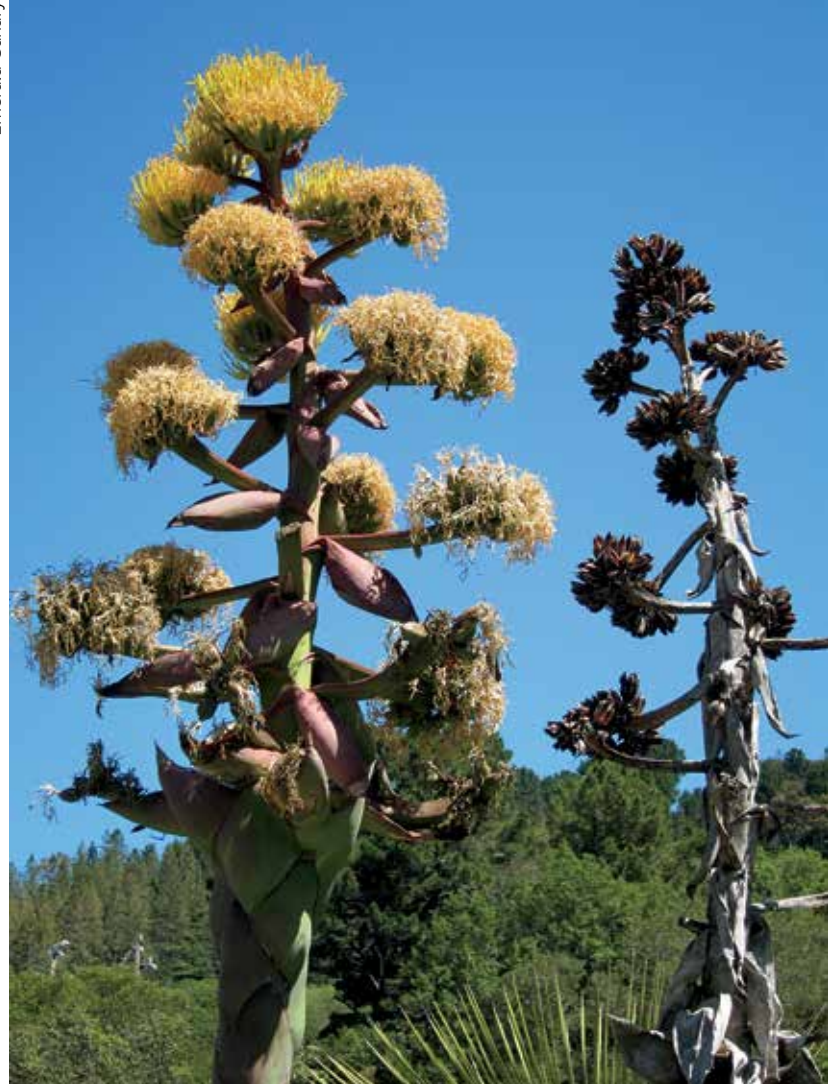
Shaw's agave (Agave shawii)

time of construction, a nearby nursery, Recon Native Plants, Inc., salvaged about 1,000 rosettes of these agaves, athough the majority of them were later sold commercially (Vanderplank, 2014). How could such a thing happen to such a rare and beautiful plant in the United States? By unanimous vote of the US Senate, and by a House of Representatives vote of 368 yeas, 58 nays (3 republicans, 54 democrats, and 1 Independent), and 1 vote of "present" (democrat), the 109th Congress passed, and President George H.W. Bush signed into law, a bill that specifically permitted the construction of 17 miles of border fence in San Diego County without having to comply with any state or federal environmental laws. Thus, the largest of only two known US populations of Agave shawii var. shawii (and the only US population of palo blanco, Ornithostaphylos oppositifolia) were removed by our government.